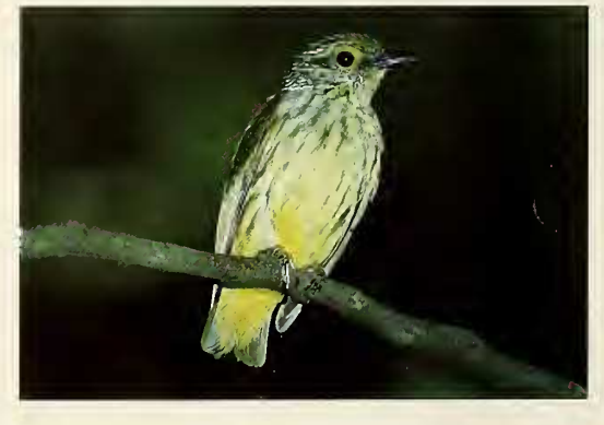
Schlegel's Asity Philepitta schlegeli male and female. Ampijoroa, Madagascar, December 1993. Philepitte de Schlégel Philepitta schlegeli mâle et femelle. Ampijoroa, Madagascar, December 1993.